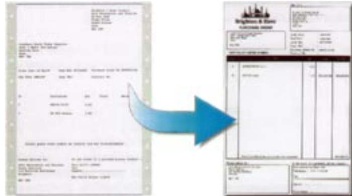
AutoFORM transforms this...